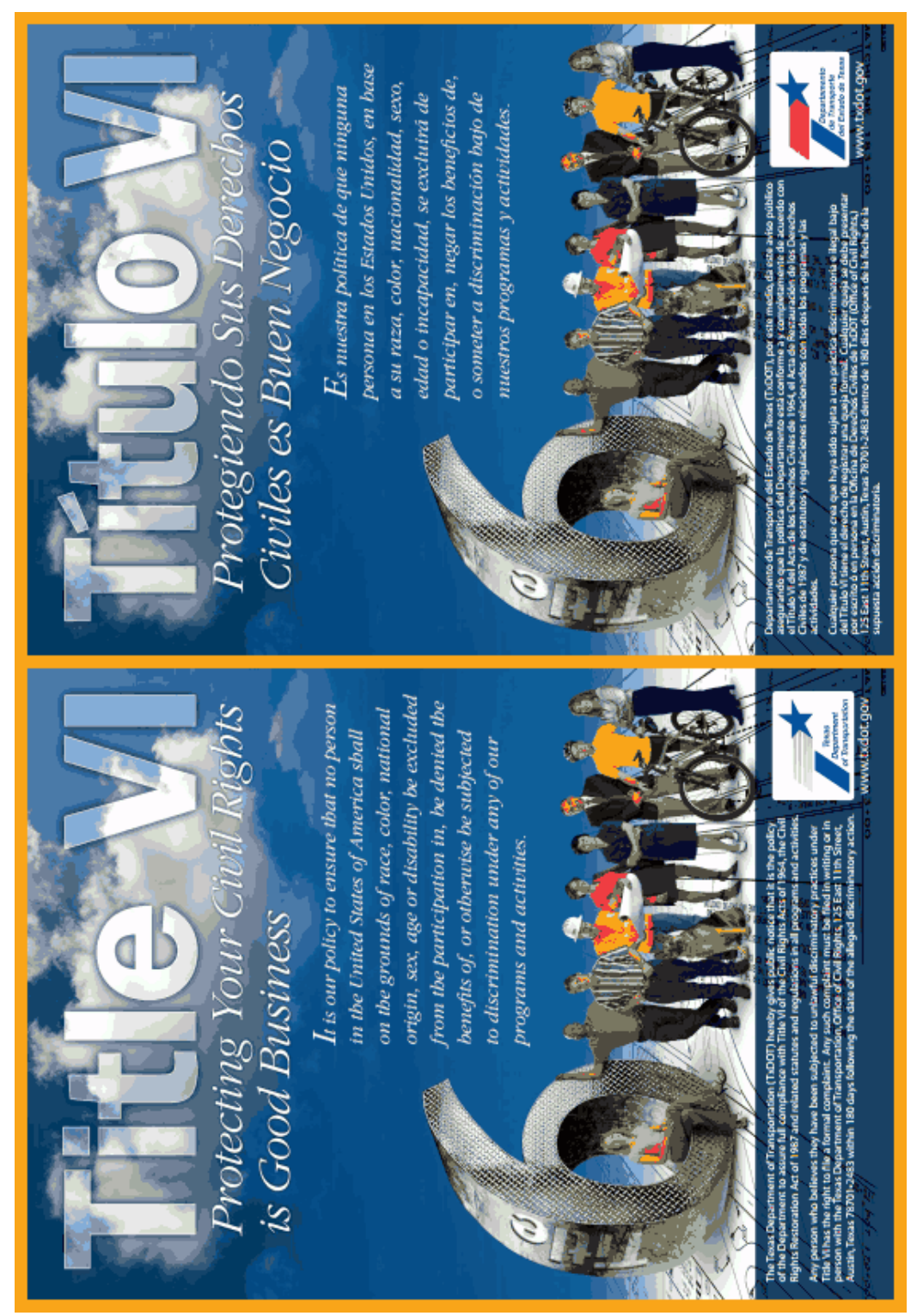
(print in full size 8 ½ x11)